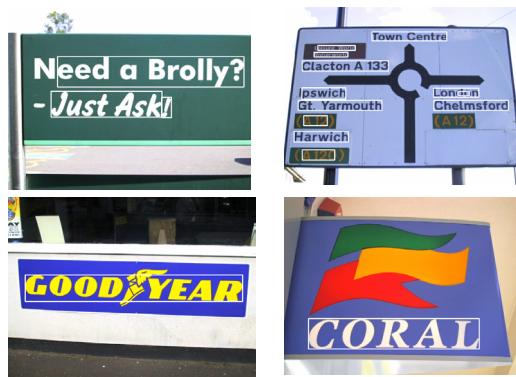
Figure 4. Detection results.