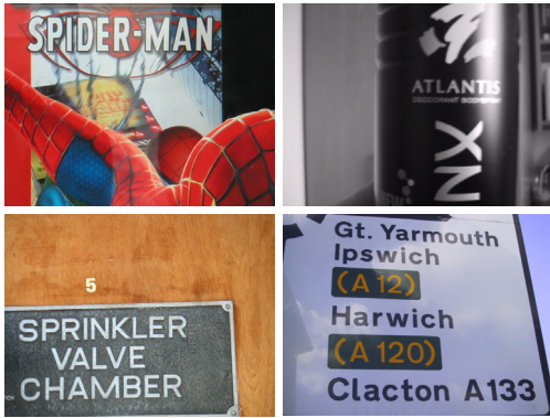
Figure 1. Example images from ICDAR '03 datasets.

on disparate feature sets and then use recognition results to obtain cleaner augmented data. The new approach works as follows. First, the algorithm extracts two feature sets: edge features and color features respectively for each image patch. Second, two margin-based classifiers are trained on these two feature sets using only labeled data. Next, the co-training algorithm comes to play with guidance of Optical Character Recognition (OCR) output. We add a data point into the positive set only when the classifier predicts it as “positive” and also OCR finds text(s) in it. Similarly, a sample is added to the negative set only when it is predicted as “negative” and OCR does not find any text(s) in it. Both conditions must be satisfied in order to move an unlabeled sample to either the positive or the negative set.