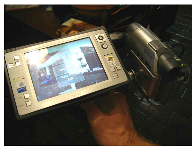
(a) eMediaTE on prototype smart camera.

Capture shot: Having selected a shot suggestion to attempt, the user records footage. Upon completion of the shot recording, the user is asked to indicate whether or not they thought they succeeded. Their response, either yes or no, translates directly to the attached inferences about metadata of the footage. For a 'yes' response, crucially, annotation of a nature that is difficult to arrive at automatically, is obtained. E.g., regarding framing type (close-up, long shot) and subject presence (George is present in this shot). No user-derived metadata